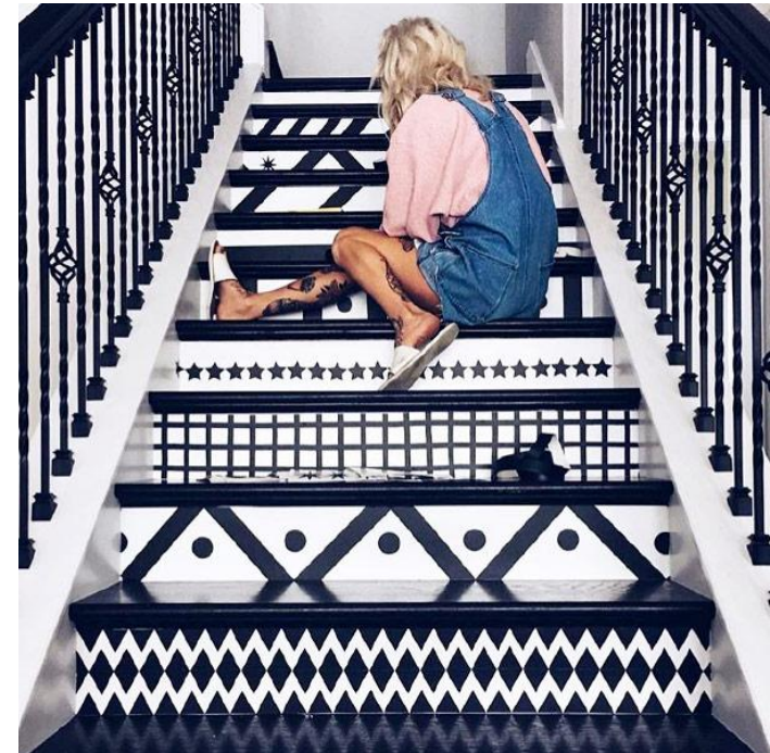
Easy Stripe Peel and Stick Wall Decals

Like ceilings, stairs aren't the first thing that come to mind when you think about making a statement, but hey, why not?! Add some whimsy if it makes you smile, especially in high-traffic areas where you'll reap maximum enjoyment.