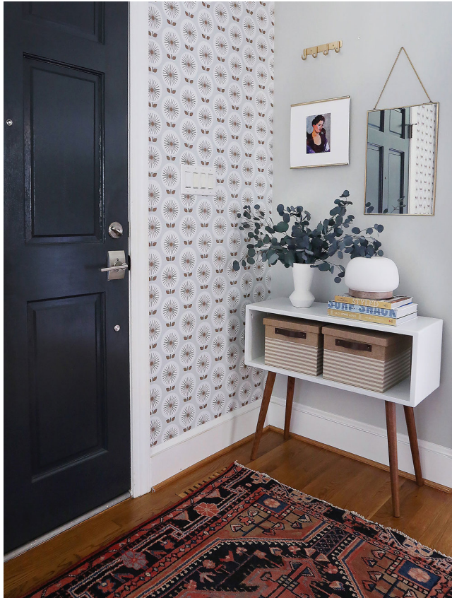
Wallpaper: Sunburst by Chasing Paper