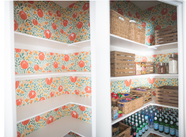
Wallpaper: Bract Removable Wallpaper by WallsNeedLove