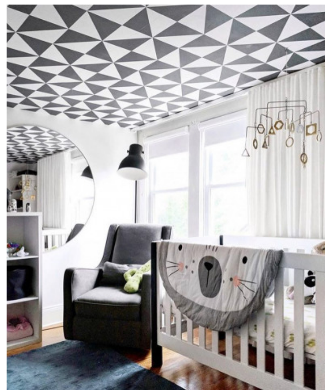
Wallpaper: Tri-Angled by Chasing Paper

Don't overlook the 5 th wall in every room, people: the CEILING! I love how they put this eye-catching geometric pattern up high in this nursery, catering to itty-bitty occupants who spend a LOT of time on their backs.