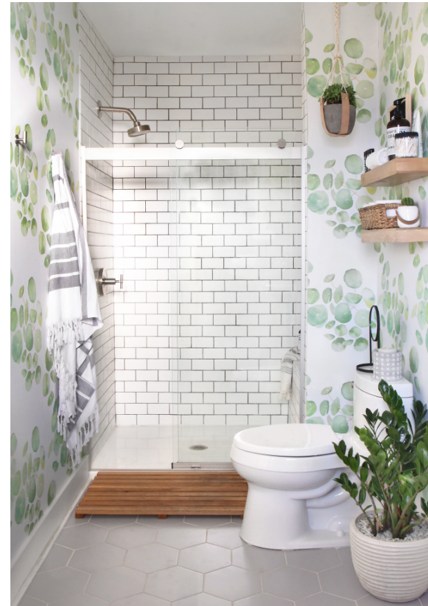
Wallpaper: Spring Leaves by Chasing Paper

Try to imagine this mostly-white guest bath without the nature-inspired wallpaper. It wouldn't be nearly as captivating, would it? I love how the natural wood shelving, cedar bath mat, and potted plants stay on theme.