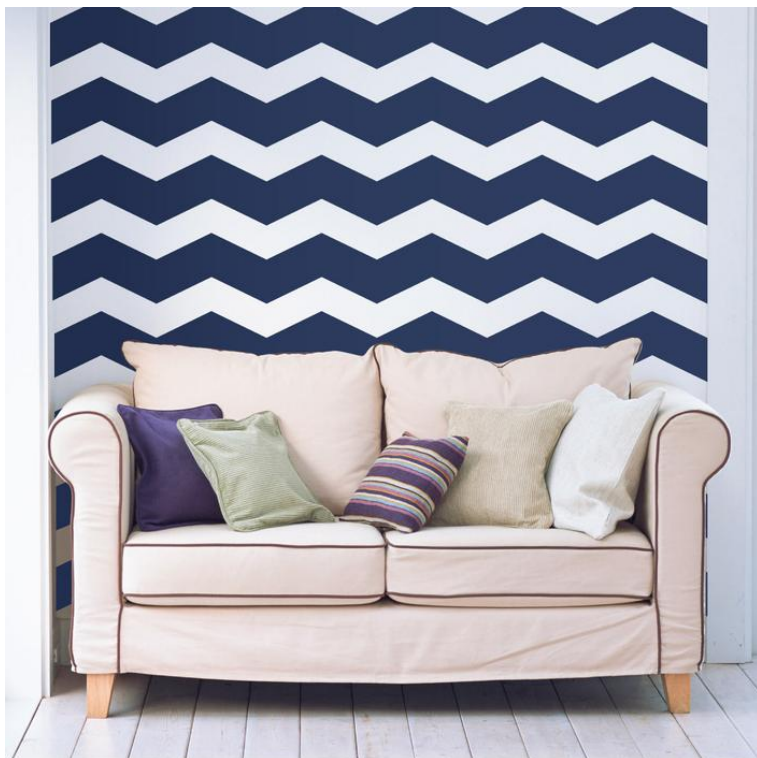
Wallpaper: Chevrons Wall Decals by WallsNeedLove