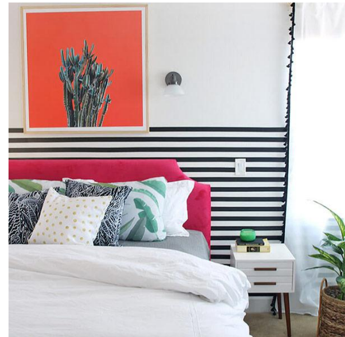
Wallpaper: Easy Stripe Peel and Stick by WallsNeedLove

Peel and stick is the way to go. Got a rogue stripe trying to veer off course? Just pull it up and get that sucker back in line.