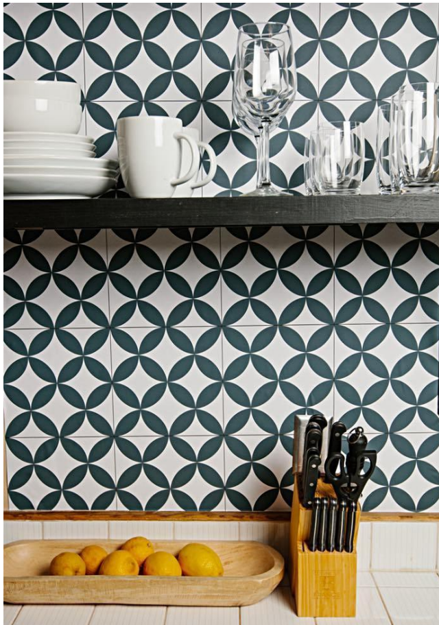
Wallpaper: Farmhouse Tile by Chasing Paper