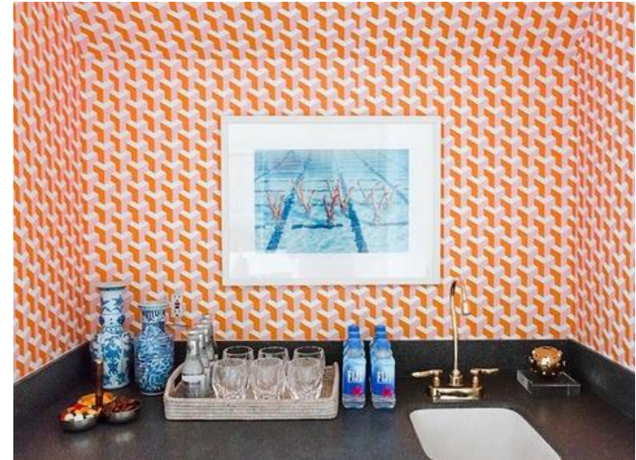
Wallpaper: Y Not Removable Wallpaper in Pushpop by wallshoppe