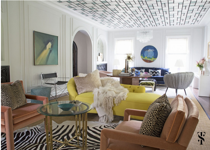
Wilmette Historical Home Wallpaper: no clue (may not even be removable but it's cool inspo!)