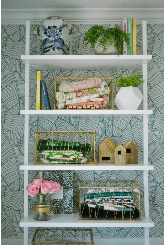
Wallpaper: The Palms in White by WallsNeedLove)