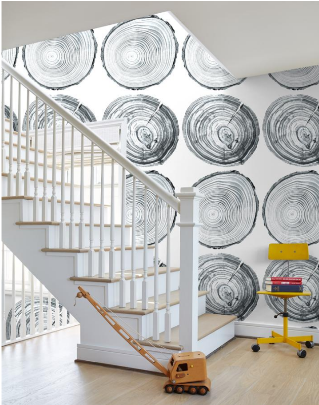
Wallpaper: Deux Bois Removable Wallpaper — Gray

How about this hallway? Wouldn't hauling laundry up and down these stairs be a little happier journey day in and day out?