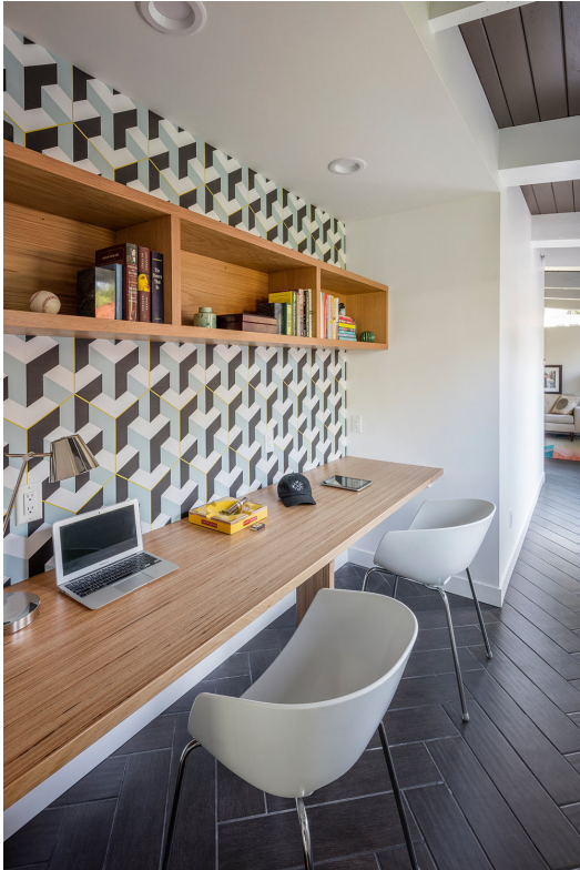
Wallpaper: Porto Tile by Chasing Paper

Think about some of the smaller spaces in your house. Bookcases. Closets. Pantries. Laundry rooms. Mudrooms. Entryways. Wet bars. Even backsplashes. Dial up the energy in these cozier spaces with a little wallpaper. Inject color, texture, and personality. BAM!