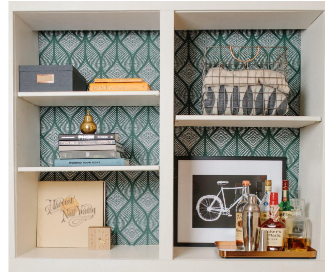
Wallpaper: Modern Damask in Green by Chasing Paper